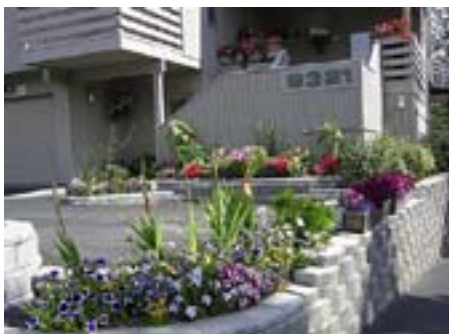
Summer flowers in the beautiful gardens

Reservations must be made 7 days in advance. Minimum reservation is for 3 nights; single or double nights approved on a "last minute" basis or unless 1-2 nights is all that is available. A reservation deposit of one night due 7 days after arranging reservation and 50% of the total if staying 5 or more nights, is due no later than ten (10) days prior to the reservation date. Reservation deposits by cashiers check, money order, personal check or credit cards are accepted. Balance is due upon arrival.