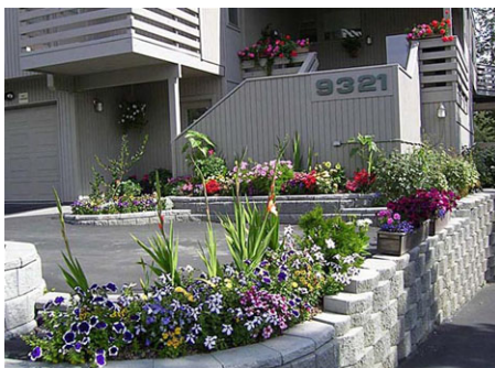
Summer flowers in the beautiful gardens

Reservations must be made 7 days in advance. Minimum reservation is for 3 nights; single or double nights approved on a "last minute" basis or unless 1-2 nights is all that is available. A reservation deposit of one night due 7 days after arranging reservation and 50% of the total if staying 5 or more nights, is due no later than ten (10) days prior to the reservation date. Reservation deposits by cashiers check, money order, personal check or credit cards are accepted. Balance is due upon arrival.